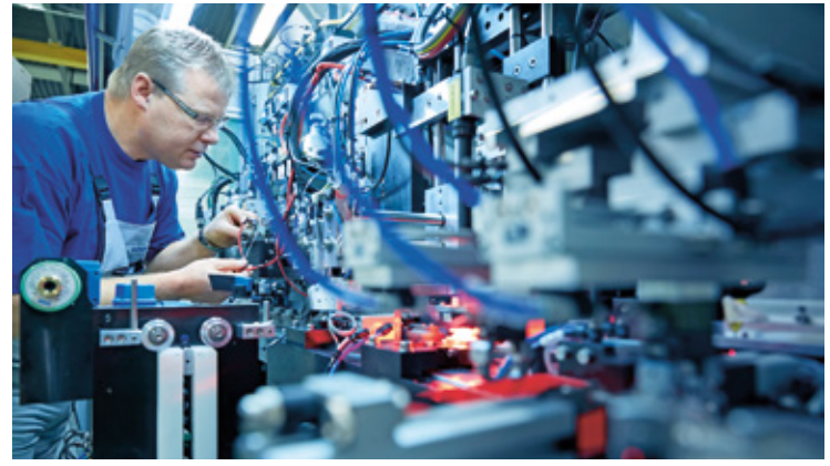
Production of electronic assemblies