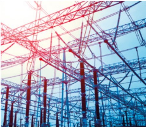
Electrical engineering for the supply of energy